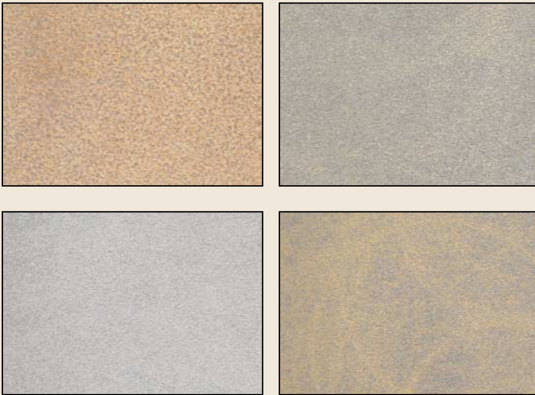
Fig. 2 - Rust grades C and C HB2 1/2

know if its products will perform over an “unknown” surface (i.e., one that does not meet specified standards).