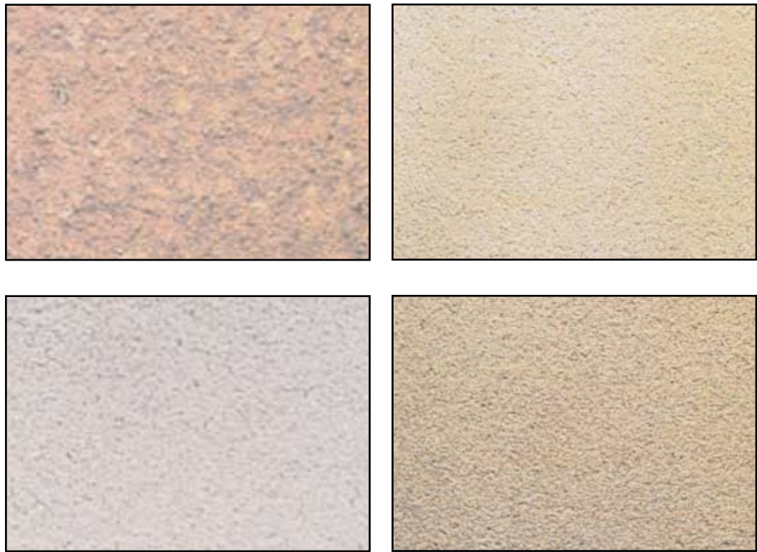
Fig. 4 - Rust grades C and C SB2 1/2

First, they had to define 2 standards of wet blasting that showed varying degrees of flash rusting. These standards could then be used to test products over “known” surfaces and link the standards to product approval. For example, a product could be tested over a surface prepared to the HB2