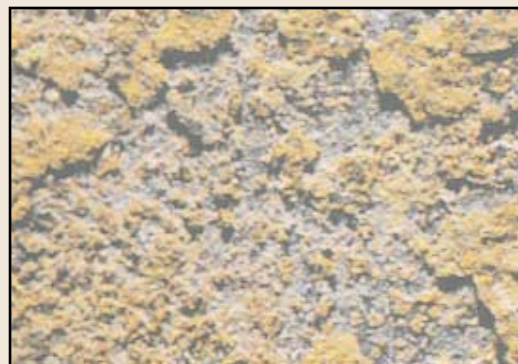
Fig. 1 - Rust grades C and D

Near White Blast Cleaning). The customer will usually (but not always) incorporate the surface preparation requirements into the contract for the work performed.