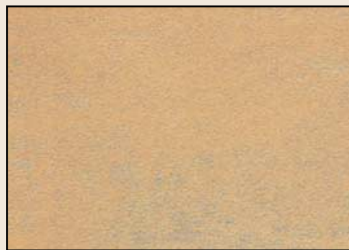
Fig. 3 - C HB2 1/2L, light flash rusting; C HB2 1/2M, moderate flash rusting; and C HB2 1/2 H, heavy flash rusting

The lack of specification standards for wet blasting has become more obvious in recent years. Environmental restrictions on dry blasting and resulting economic pressures have led to an increase in wet blasting operations worldwide. In addition, many ship owners are using wet blasting for on-board maintenance. Questions from our customers about wet blasting standards