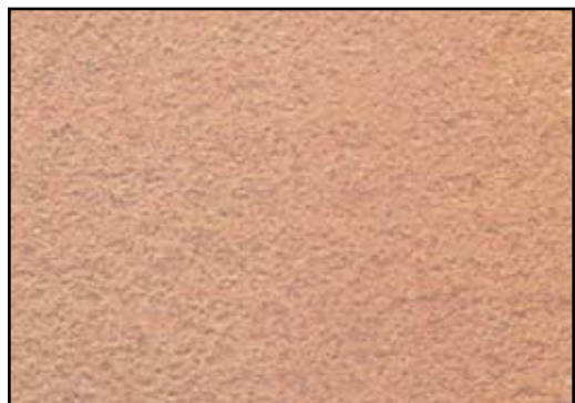
Fig. 5 - Rust grades C and C SB2 1/2L, light flash rusting; C SB2 1/2M, moderate flash rusting; and C SB2 1/2H, heavy flash rusting

The wet blasting standards for steel were developed to meet 2 requirements.