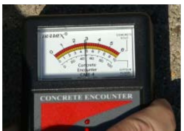
Test Zone #2 SpinJet with Vacuum Recovery – Moisture Reading at two minutes after jetting: 2.9% H20.