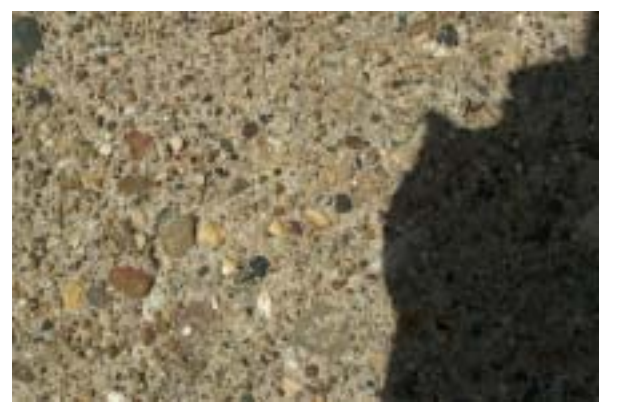
TEST ZONE #2 SpinJet with Vacuum Recovery – Clean Surface, no dust, No dirt, no moisture, of and kind.