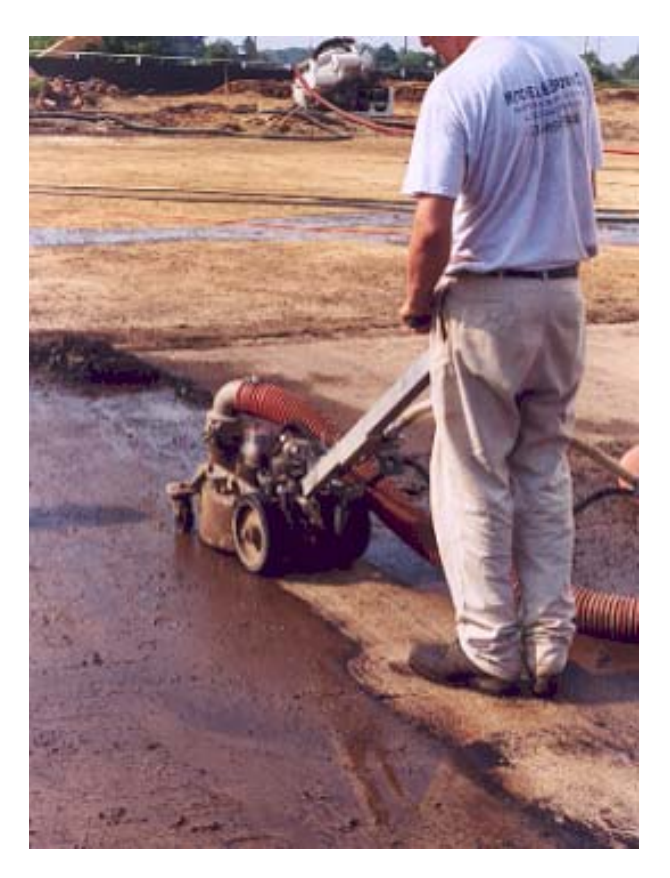
Figure 8. Membrane removal from a concrete surface.