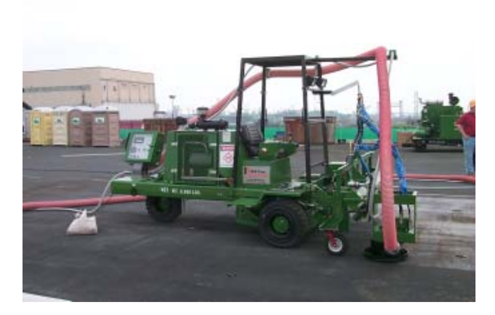
Figure 5. Second generation coating removal systems combine the advantages of the original systems with new features that improve productivity.