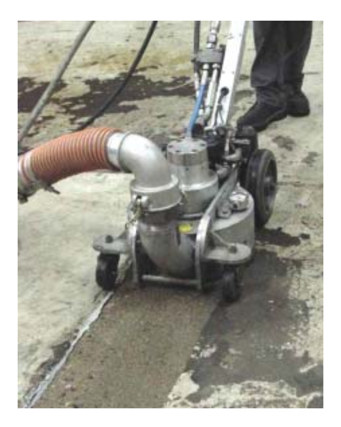
Figure 3. Semi-automated tools are the most popular for performing coating removal from concrete.