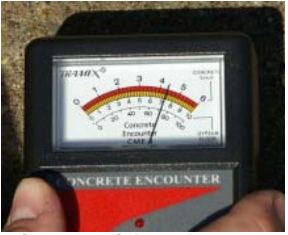
TEST ZONE #2 SpinJet with Vacuum Recovery –Moisture Reading at five seconds after jetting: 4.4% H20.