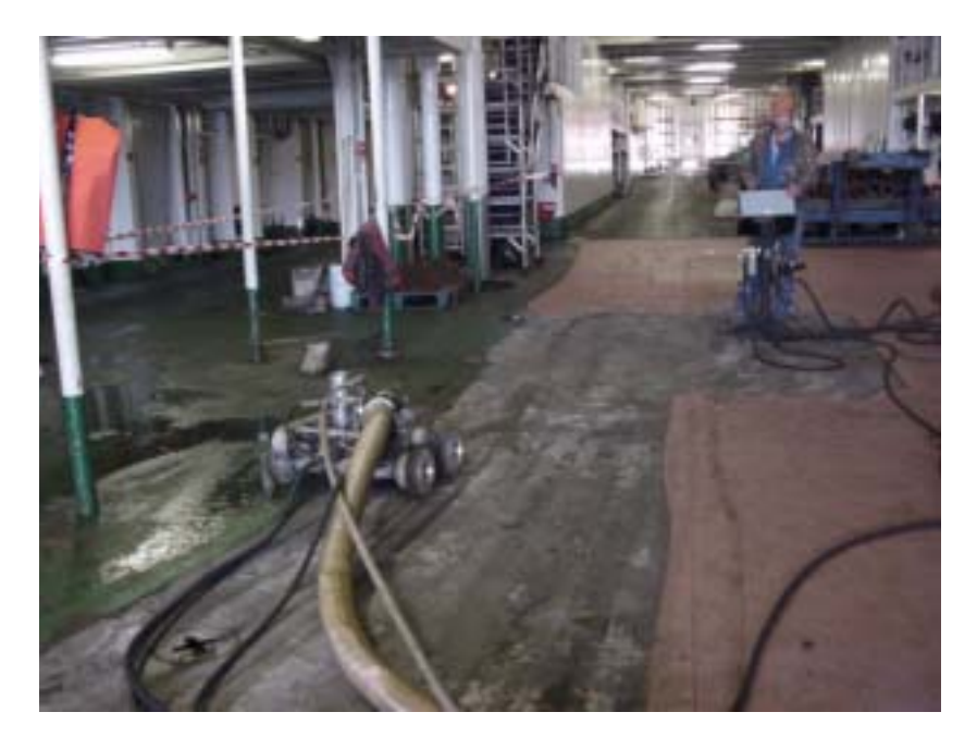
Figure 4. A second variation of the semi-automated tool is a crawler type device. This system has the added advantage of being able to do work on vertical surfaces.