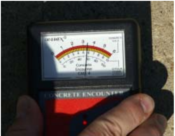
TEST ZONE #2 SpinJet with Vacuum Recovery – Pre-Test Moisture Reading Of 3.4% H2O.