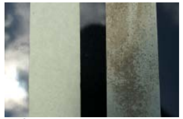
TEST ZONE #2 and #3 Pull Test The Vacuum Recovery SpinJet leaves A clean surface (on left)