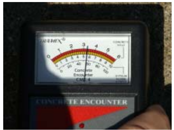
TEST ZONE #2 SpinJet with Vacuum Recovery – Moisture Reading at one Minute after jetting: 3.3% H20.