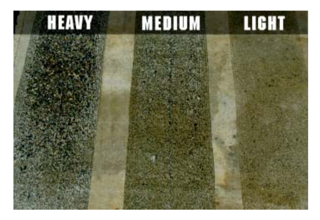
Figure 7. Additional applications include various levels of concrete scarification.