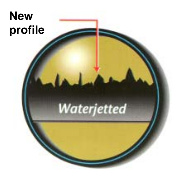
Figure 2. Water jetting exposes the aggregate in the concrete, proving an excellent bonding surface for the new coating system.